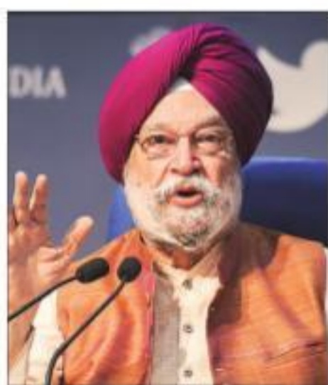
Union minister for civil aviation Hardeep Singh Puri